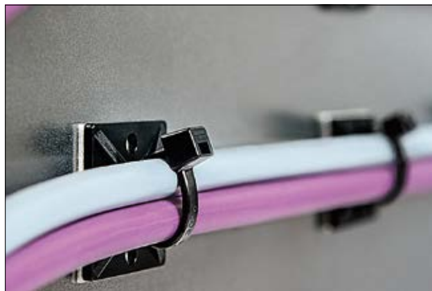
MB-Series Mounts with square design.