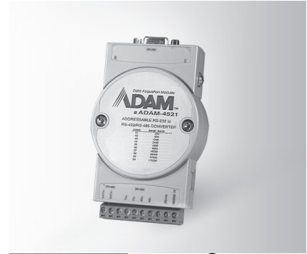
ADAM-4521 UL US LISTED ENEC IEC RoHS COMPLIANT 2002/95/EC